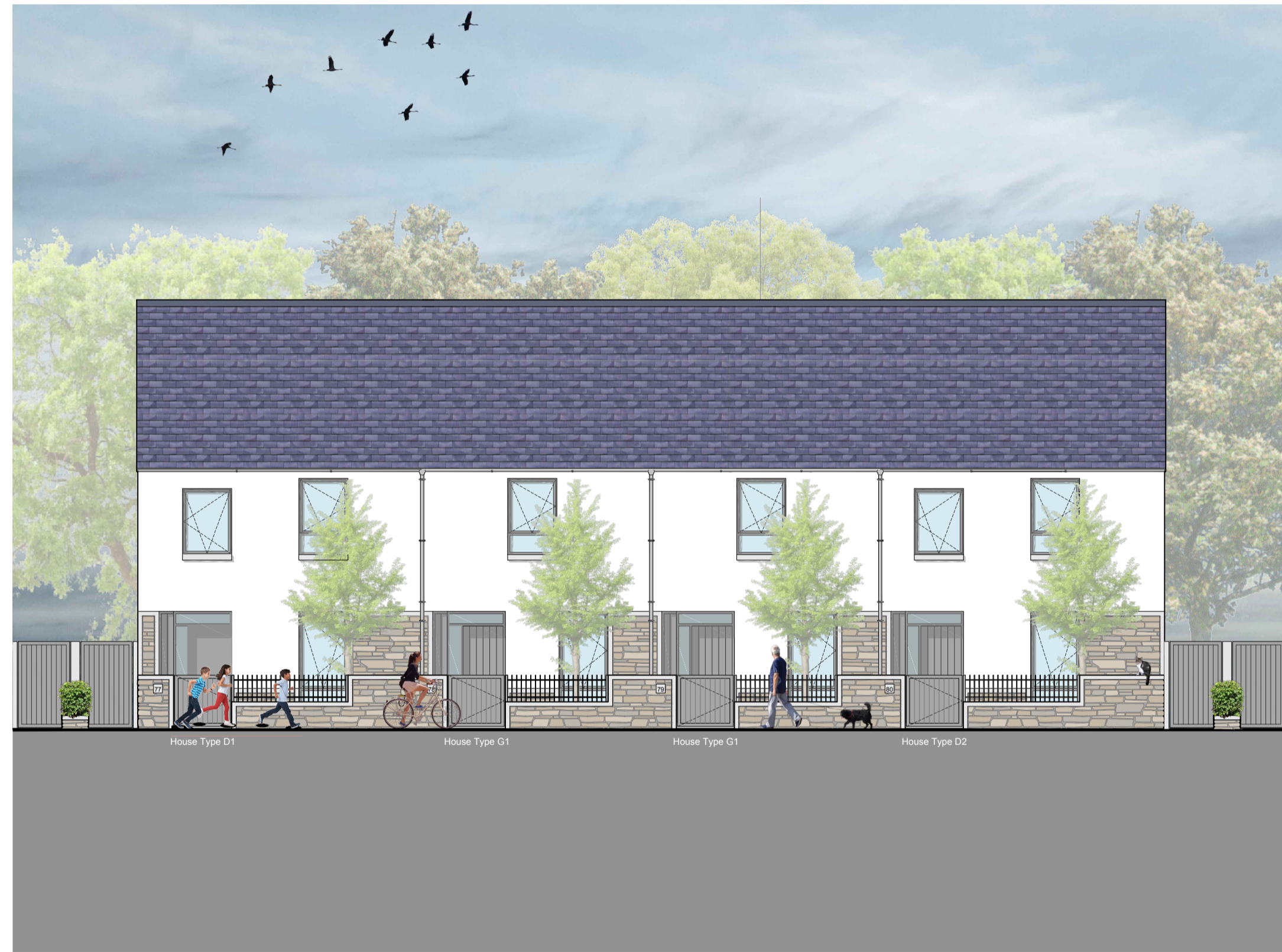
HOUSE TYPES D and J - FRONT ELEVATION AND CURTLAGE DETAILS SCALE 1:100